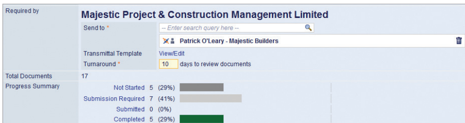
The graphical package display summarizes the progress of documents in each manual

Track and report on the progress of each manual via easy, graphical reporting.